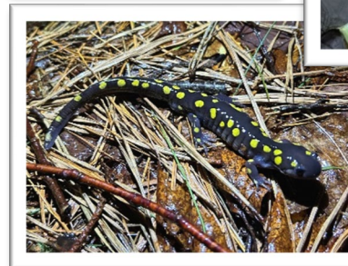
Spring peeper, spotted salamander, and spotted salamander egg masses all found in or near BCT Vernal Pools