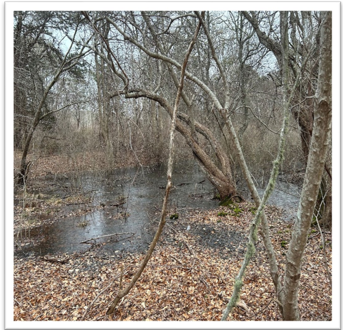
Vernal Pool along BCT's Vernal Pool Trail

For more information on Vernal Pools in Massachusetts and their certification, check out Natural Heritage and Endangered Species Program (NHESP's) Vernal Pool Page or the Vernal Pool Association Website .