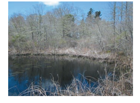
There's also a pond that ducks and other waterfowl love.