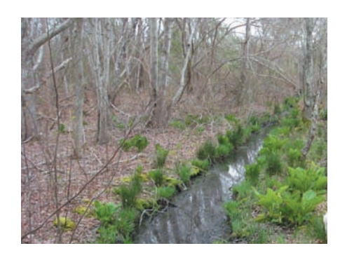
A donation of 7.94 acres off A P Newcomb Road boasts an old bog with springtime skunk cabbage.