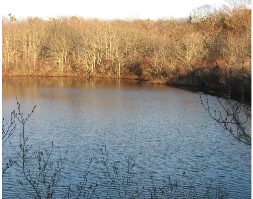
Looking east across Dollar Pond towards Swift Bog

Now, with your help, we have a chance to purchase this parcel connecting our other preserved lands. We negotiated a $60,000 bargain sale with the seller and have $30,000 left to raise. Help us save one of our Priority Ponds!