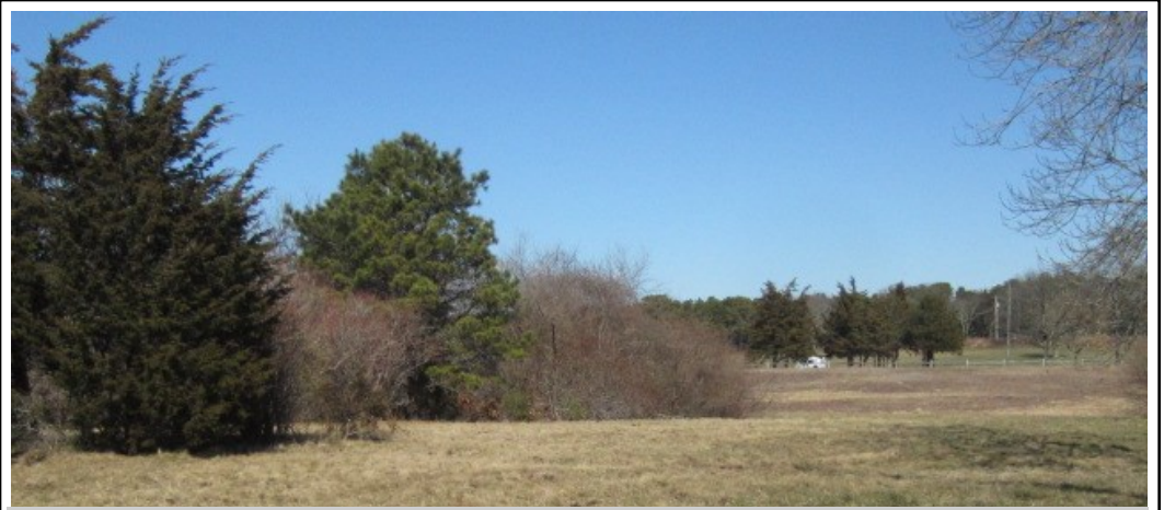
The fields at Windmill Meadows preserve the scenic view to the windmill and Whale Rock.

You can help us save the most cherished view on Main Street—Windmill Meadows in front of the historic Higgins Windmill. In 1986, we purchased one acre for $145,000. Now, we have a contract to purchase the adjoining acre-lot for $175,000. We will add to the visual enjoyment by clearing away more of the underbrush for better views to the windmill and our own Whale Rock, the largest glacial boulder in Brewster. A dozen large blueberry bushes will be kept to offer their summer bounty. There are very few open fields left in Brewster or on the Cape—let's pitch in to save this critical one.